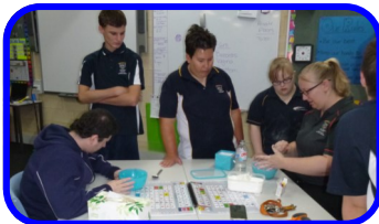
Watching how to make Oobleck, part of our science learning