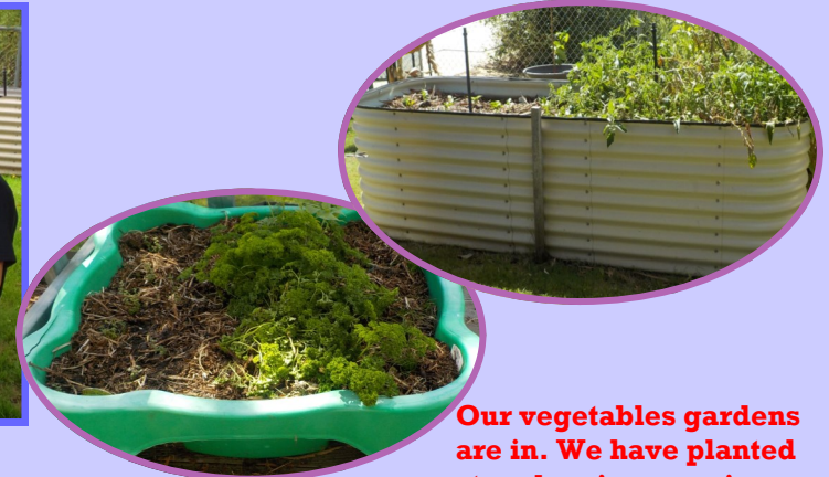
Our vegetables gardens are in. We have planted strawberries, capsicum, pak choi, broccoli, cauliflower and silverbeet